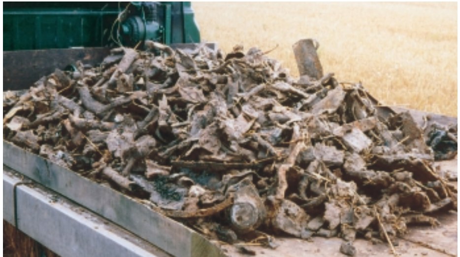
Because of contemporary recovery operations and subsequent agriculture, survival at most lowland crash sites will often consist of nothing more than a surface scatter of debris. The wreckage in the illustration – all that remains of a Vickers Wellington bomber weighing 12,000kg – represents the result of a careful magnetometry survey followed by systematic recovery.