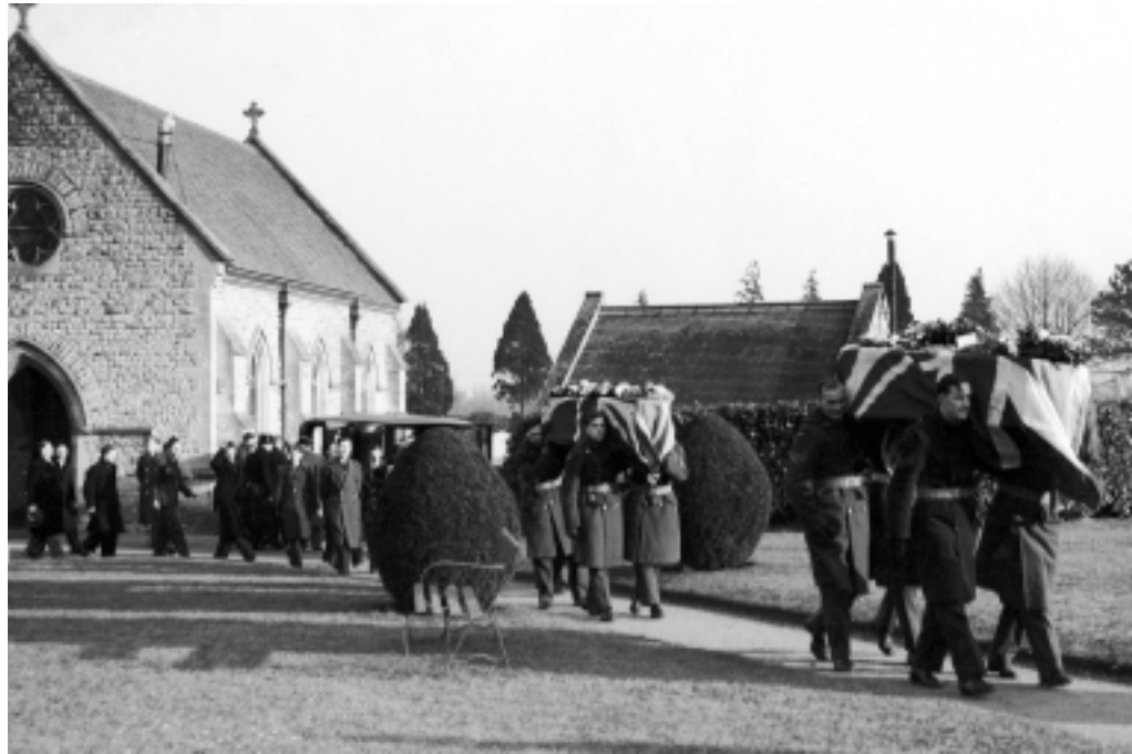
Many crashes involved fatalities. It is estimated that in the region of 80,000 aircrew of all nationalities were killed flying from or over the UK during WWII. Not all of these losses occurred as a result of combat; RAF Bomber Command alone lost 8,000 aircrew in training accidents. The photograph shows a common wartime scene: RAF aircrew from a Midlands-based Operational Training Unit being buried with full military honours

In many cases investigation may reveal nothing more than small surface scatters of debris. In others, however, substantial pieces including engines, portions of airframes and the equipment and effects of crew members may survive. At a very few sites – chiefly those in inaccessible areas such as mountains, marshland or inter-tidal zones – large components still lie where they fell.