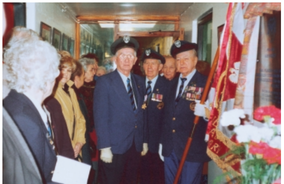
Crash sites are places of loss and commemoration. In 1980 building work for a school-based community centre in Wigston, Leicestershire, uncovered the remains of a Polish Air Force Avro Lancaster which had crashed on the site in 1946, killing the crew. Today, a memorial plaque in the school is the focal point for an annual service conducted by members of Leicester's large Polish community.

wishes to minimise the potential risks to excavators and has a moral obligation to the families of dead servicemen to protect their relatives' remains from disturbance, hence applications for a licence to excavate will be refused where there is a risk that such operations may disturb either ordnance or human remains. Even where a licence is granted, however, aircraft wreckage may include items of equipment other than weapons and ammunition that can pose a potential danger, even though they were not regarded as hazardous when the aircraft was lost. For example, the dials of many aircraft instruments were painted with radium-based luminous paints; instruments so treated are now regarded as posing a significant radiological hazard. A note of guidance, available on application