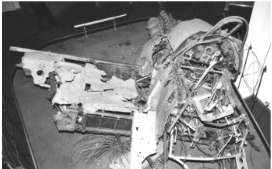
Under certain circumstances, preservation in tidal or inter-tidal zones can be exceptional. The cockpit, centre section and Merlin engine of this Hawker Hurricane, a casualty of the Battle of Britain, were recovered from the beach at Walton on the Naze in Essex, and are now on display at the RAF Museum, Hendon.