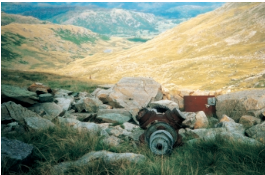
Propeller stubs and reduction gear (above) and remains of a wing section (below) from a Halifax that crashed in the Lake District in 1944. Although much depleted by souvenir hunting and recovery, upland crash sites represent the only places in England where recognisable or substantial remains still lie intact on the surface.

Some crash sites are visible, for example as spreads of wreckage within upland environments, or are exposed at low tide. In most cases, however, a scatter of surface debris may mask larger deposits, often buried at great depth. The initial impetus for recoveries comes from both eyewitness reports and documentary research. The debris field can be located by systematic walking across ploughed fields to identify surface concentrations of wreckage or with a magnetometer to assess the extent of buried remains, on the basis of which a point or points of impact can be estimated. Given the potential weight of the components, and their depth, excavation is often carried out using mechanical excavators.