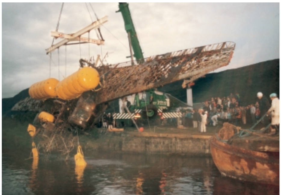
Submerged crash sites perhaps offer the best potential for the future. The remains of a Wellington bomber which crashed in Loch Ness on New Year's Eve 1939 are seen here being recovered in 1985. Carefully restored, the aircraft is now displayed at Brooklands Museum and is one of only two complete Wellingtons known to survive out of a total production run of 11,500.