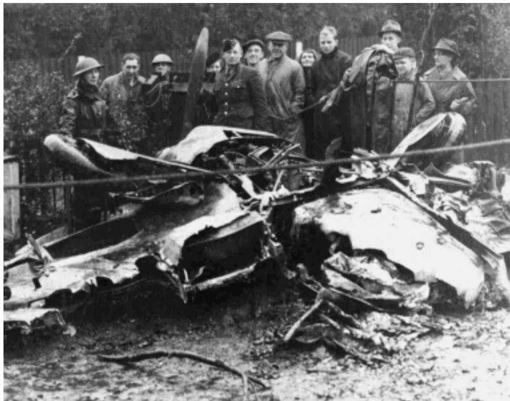
Civilians and an RAF guard gather around the wreckage of a Luftwaffe Messerschmitt 109 fighter which broke up in mid-air and fell on a London street during the Blitz. After being assessed for intelligence purposes, most such wreckage was sent for scrap.

Crash sites constitute a unique archive of World War II and earlier military aircraft. Many aircraft preserved in museums have either undergone major restoration or are late production models which have been converted to resemble